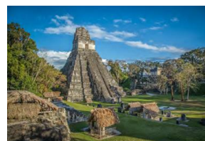
Ancient Maya periods