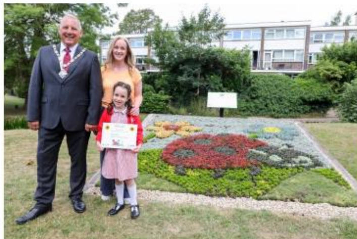
The 2025 winning carpet bed design featuring a ladybird and flowers