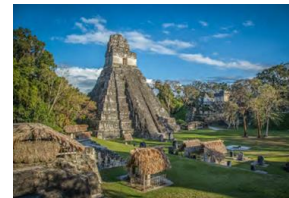
Ancient Maya periods