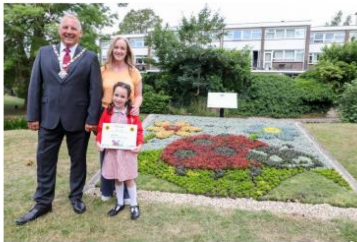
The 2025 winning carpet bed design featuring a ladybird and flowers